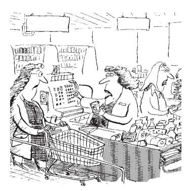
"Well it may have been 68 cents when you got in line, but it's 74 cents now!"

an increase in the overall level of prices in the economy