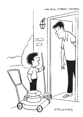
"For $5 a week you can watch baseball without being nagged to cut the grass!"

Most countries that once had centrally planned economies have abandoned the system and are instead developing market economies. In a market economy , the decisions of a central planner are replaced by the decisions of millions of firms and households. Firms decide whom to hire and what to make. Households decide which firms to work for and what to buy with their incomes. These firms